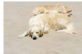
asleep in the sun