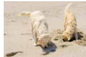
digging in the sand